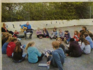
Friendships have been forged over the years between residents of the two towns