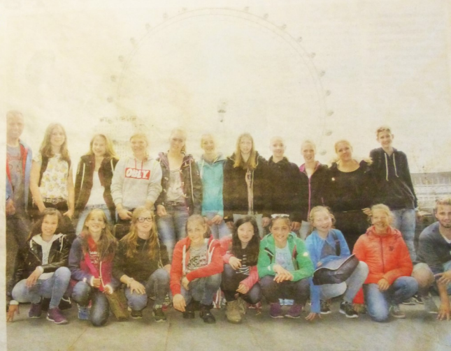
Twin town trips include sightseeing trips. The Dorsten basketball groups were shown the sights of London in a recent visit to the UK