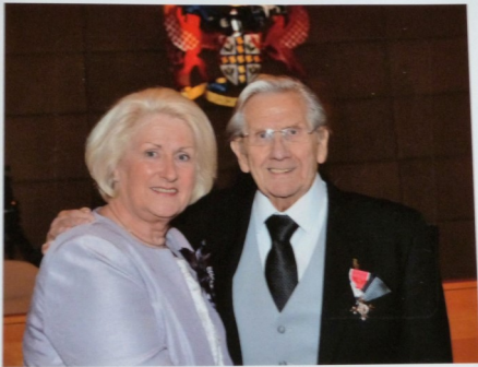
Investiture, 7th January 2016