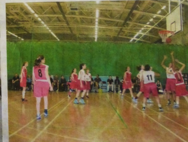
Sports teams often take part in friendlies with their twin town rivals